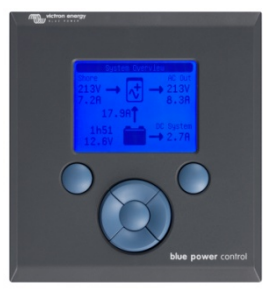
Blue Power Panel GX