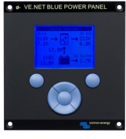
Blue Power Panel 2