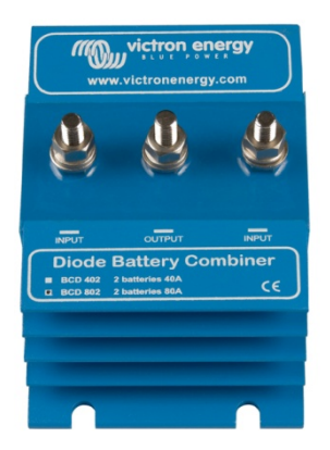
Argo Diode Battery Combiner BCD 802

Diode Battery Combiners are used to guarantee continuous DC power to mission critical equipment, such as an electronic engine control system. With a diode battery combiner two or more DC power sources can be used in parallel to supply the mission critical load. Failure of one source will not interrupt power to the critical load.